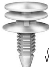
20814 (10305191) White Nylon

Door Panel Retainer Top Head Diameter: 11/16" Middle Head Diameter: 11/16" Bottom Head Diameter: 25/32" Stem Diameter: 5/16" Stem Length: 13/16" Chevrolet Impala, Lumina & Monte Carlo 2006 – 2000