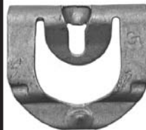
9275 Is Now Available!

We have tooled and are now manufacturing another "Popular" Window Reveal Moulding Clip