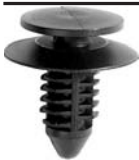
20829 (6505534-AA) Black Nylon

Door Trim Panel Retainer Top Head Diameter: 14mm Bottom Head Diameter: 18mm Stem Diameter: 8mm Stem Length: 15mm Chrysler Concorde, Intrepid, LHS & 300M 1998 – On