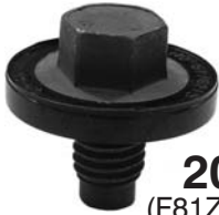
20807 (F81Z-6730-AA) Plain With Rubber Washer Face Gasket

In-Line Mini Fuse Fuseholder 30 Amp Maximum 12 Ga. Wire Use With Auveco Mini Fuses 16351 – 16360 Replaces Auveco 17648 Fuse Not Included UNIT PACKAGE: 3