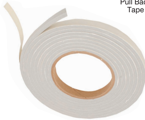
Pull Back Tape

A low density, PVC (polyvinyl chloride) foam weatherstrip with a permanent acrylic adhesive for easy application even on irregular or curved surfaces. Seals out air, moisture, dust and light as well as cushioning against vibration and noise. Remains flexible at -20° C to 80° C (-4 F to 176 F). Light gray in color.